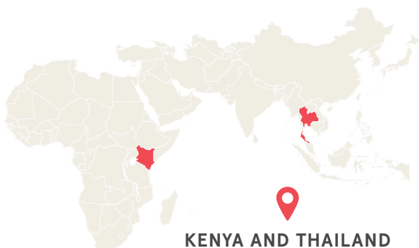
KENYA AND THAILAND

Imagine fulfilling equipment requests around the world in just a matter of days. With Jesus Film Project’s new equipment distribution centers, it is possible! Instead of shipping all equipment—such as projector sets, tablets and more—from the United States, Jesus Film Project started establishing strategically positioned centers to serve the equipment needs of partner organizations throughout the world. As of January 2022 there are two distribution centers—one in Thailand and now one in Kenya—with plans for more in other areas of the world.