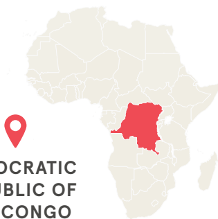
DEMOCRATIC REPUBLIC OF THE CONGO

The story of Jesus is truly for everyone.